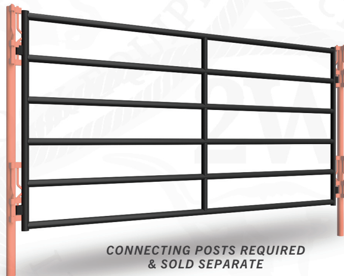
CONNECTING POSTS REQUIRED & SOLD SEPARATE

The 2W Corral Series Heavy Duty Panels are ideal for use in high pressure corral systems, high pressure pens, and handling areas. SAME HEIGHT HEAVY DUTY CONNECTING POSTS ARE REQUIRED to connect different height Corral products together. This connecting system uses an assortment of clips and post pins to connect to one another.